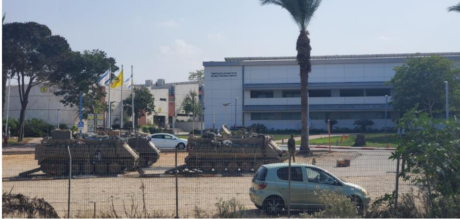
Sapir College in October 2023