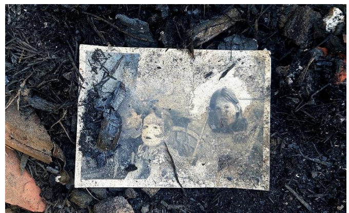
from his kibbutz - Be'eri